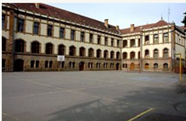
Colegiul National Pegagogic "Carmen Sylva"